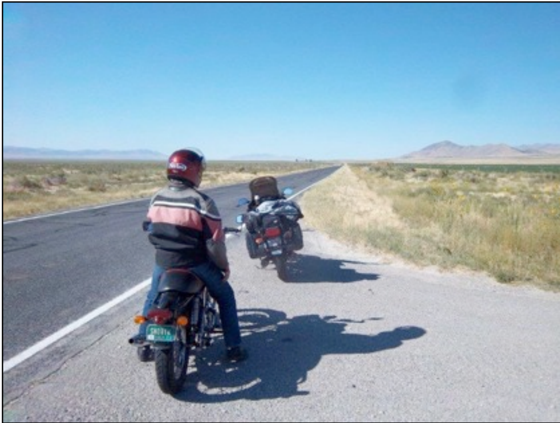
ANOTHER photo stop???