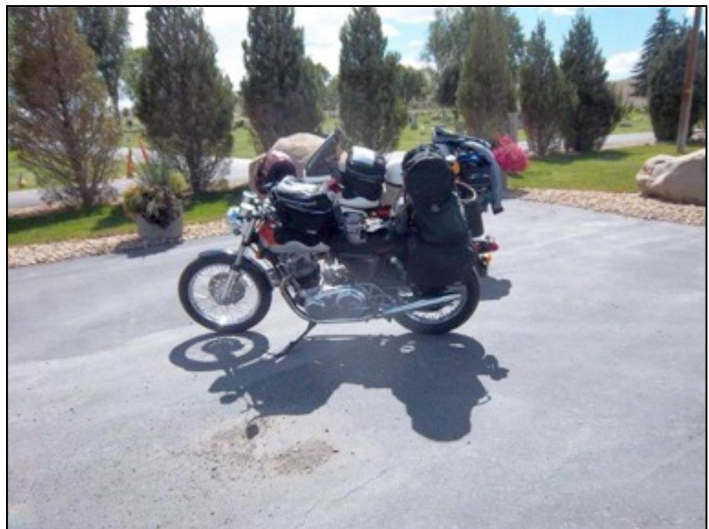
Fully laden and ready for anything!