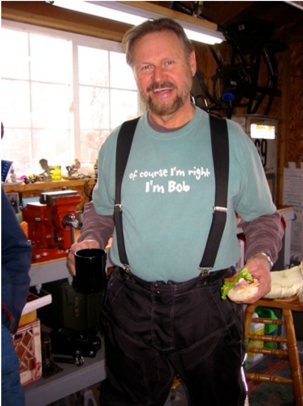
I couldn't have said it better myself!