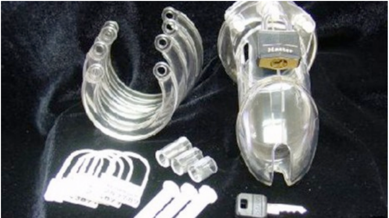
“CB-6000 chastity belt for men. Built from medical grade polycarbonate plastic, it's a complicated looking cage that fits around and over a gentleman's tackle, rendering the entire lunchbox more or less ornamental, except for bathroom trips.” A tackle box for your favorite fisherman!