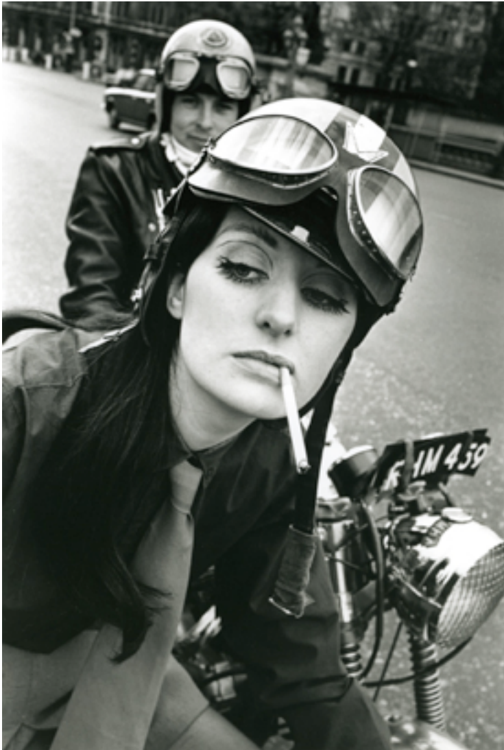
Ever wonder what became of Twiggy?