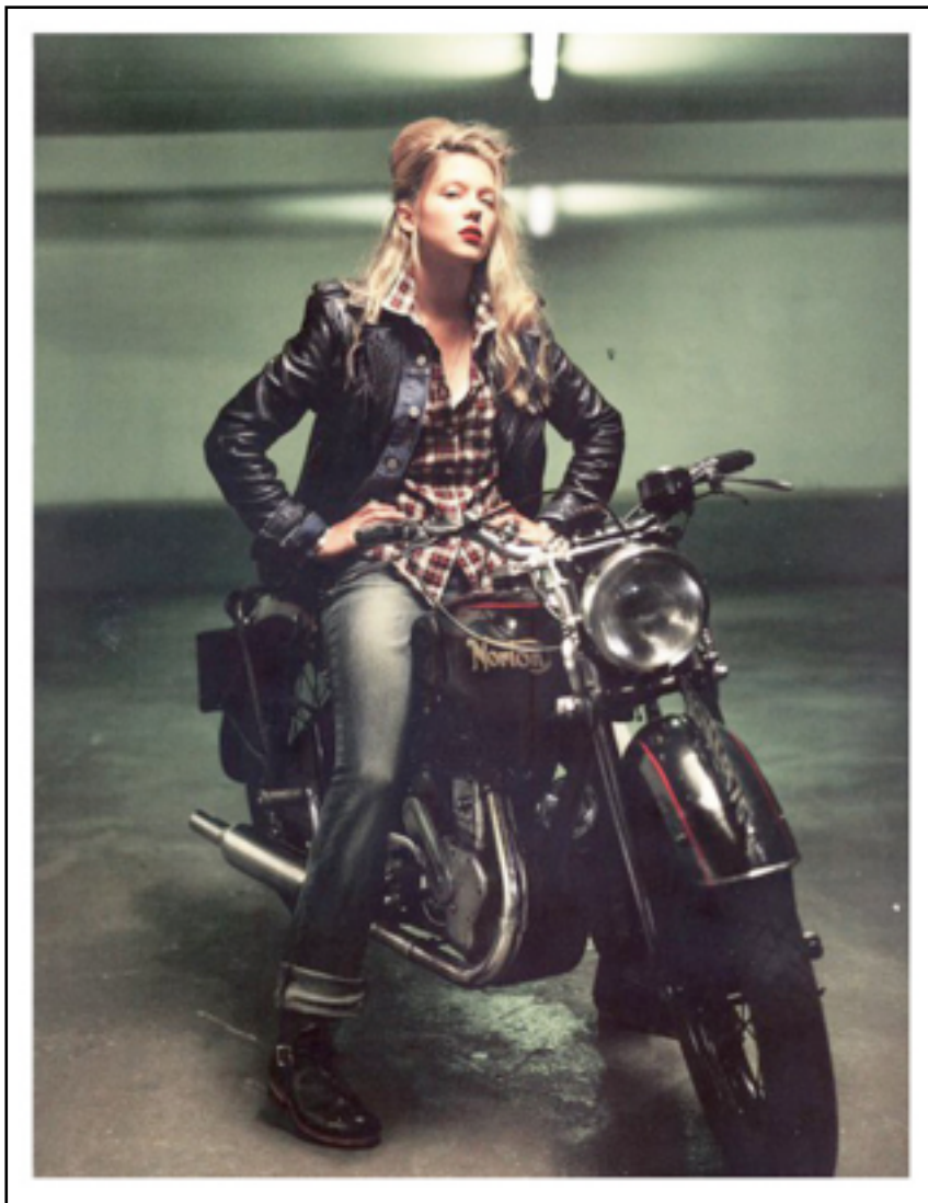
How do YOU spell attitude?